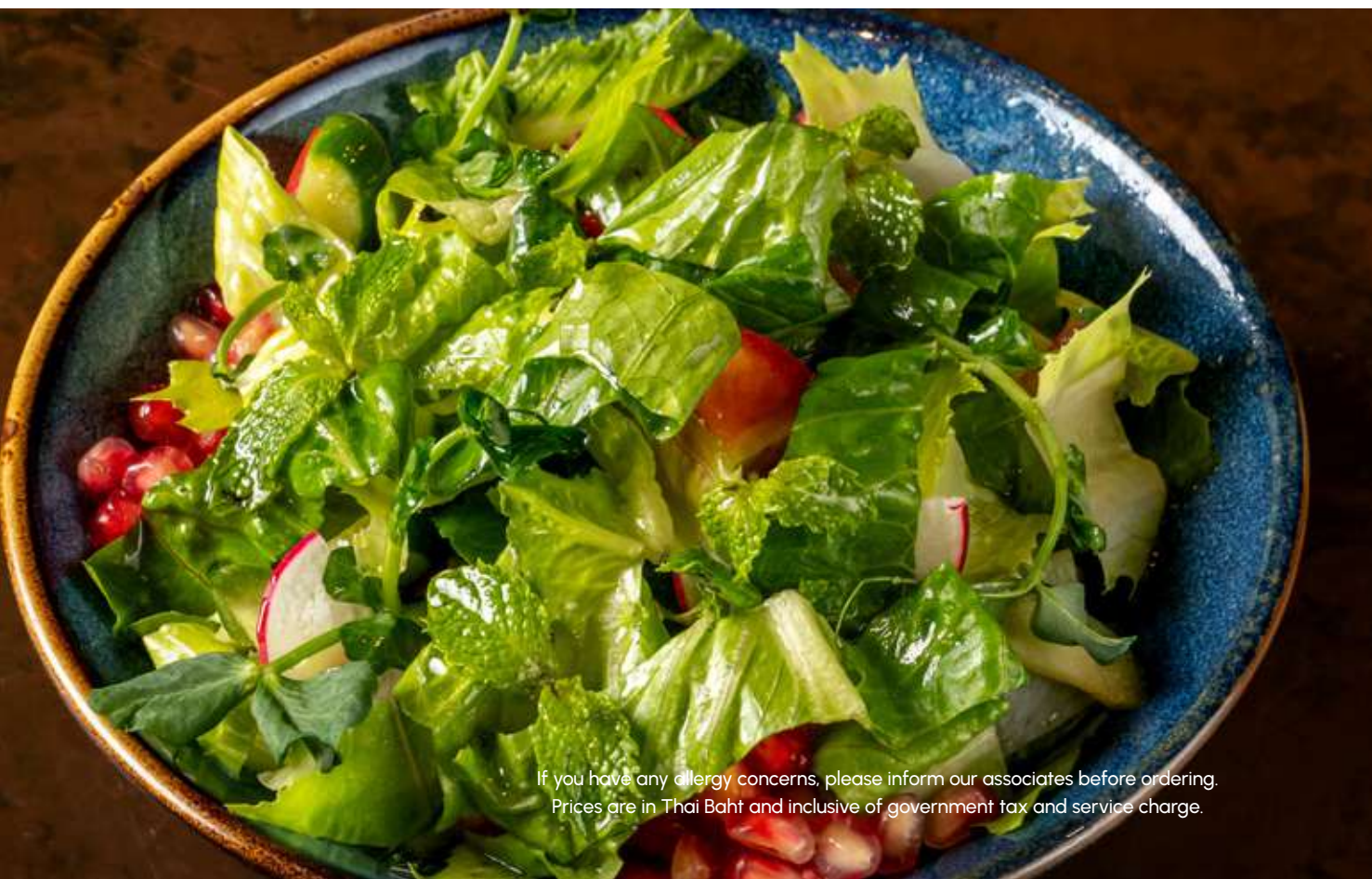
Oriental Salad 220

If you have any allergy concerns, please inform our associates before ordering. Prices are in Thai Baht and inclusive of government tax and service charge.