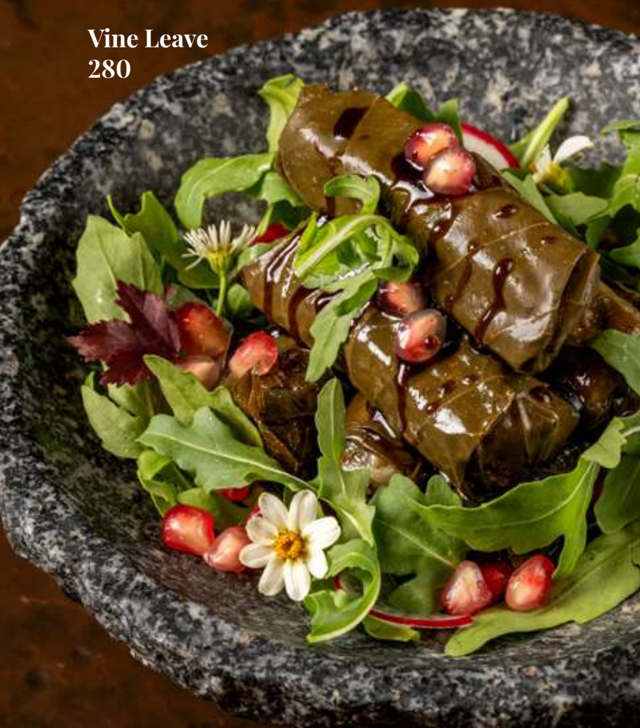
Vine Leave 280