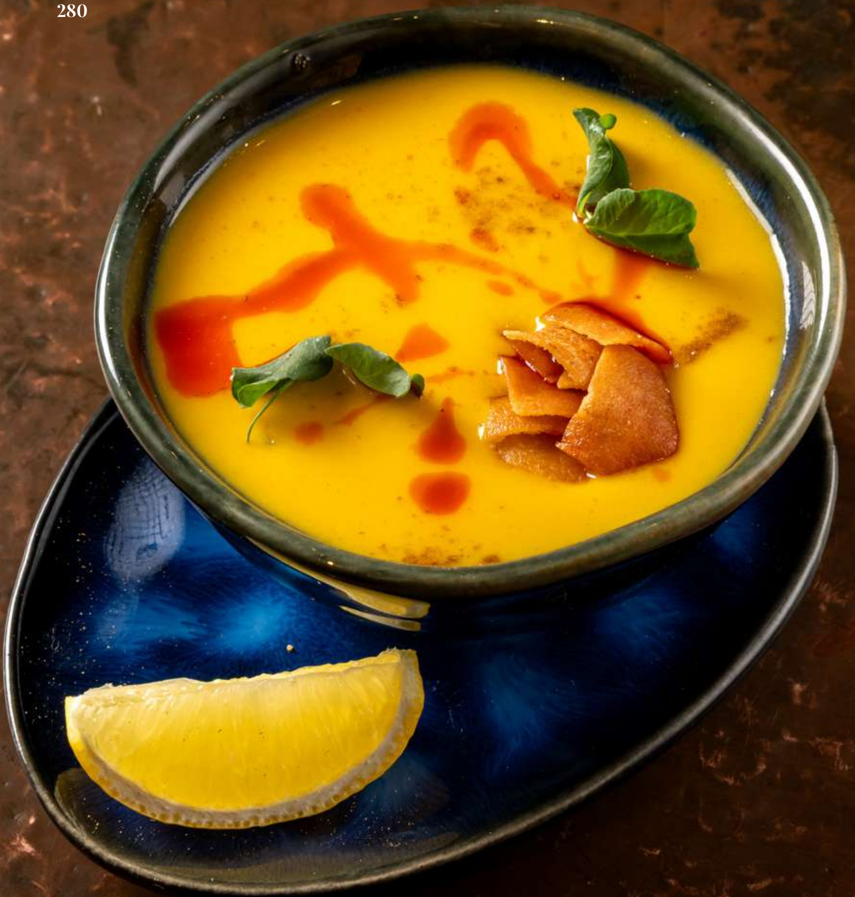
Lentil Soup 280