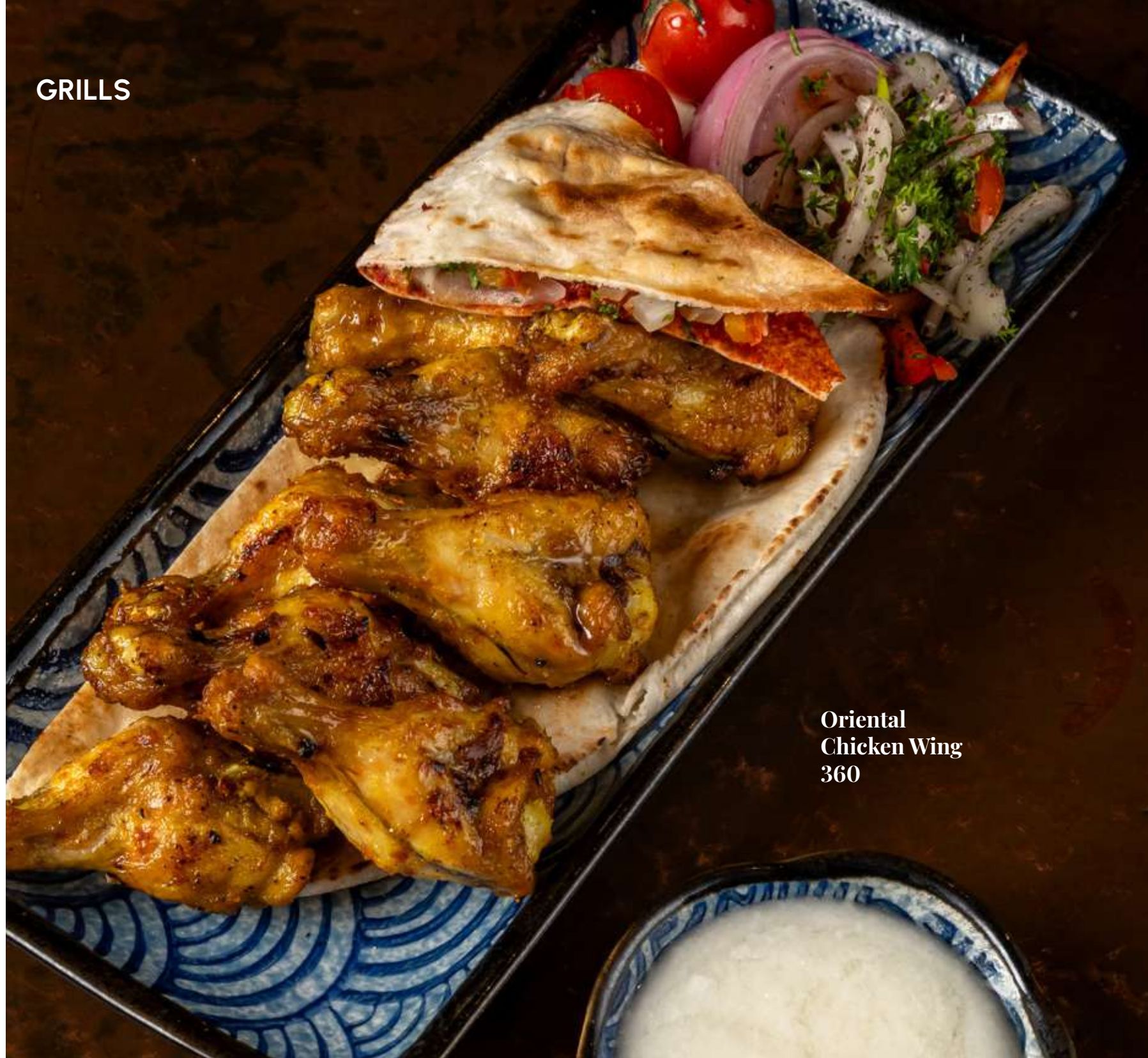
Oriental Chicken Wing 360