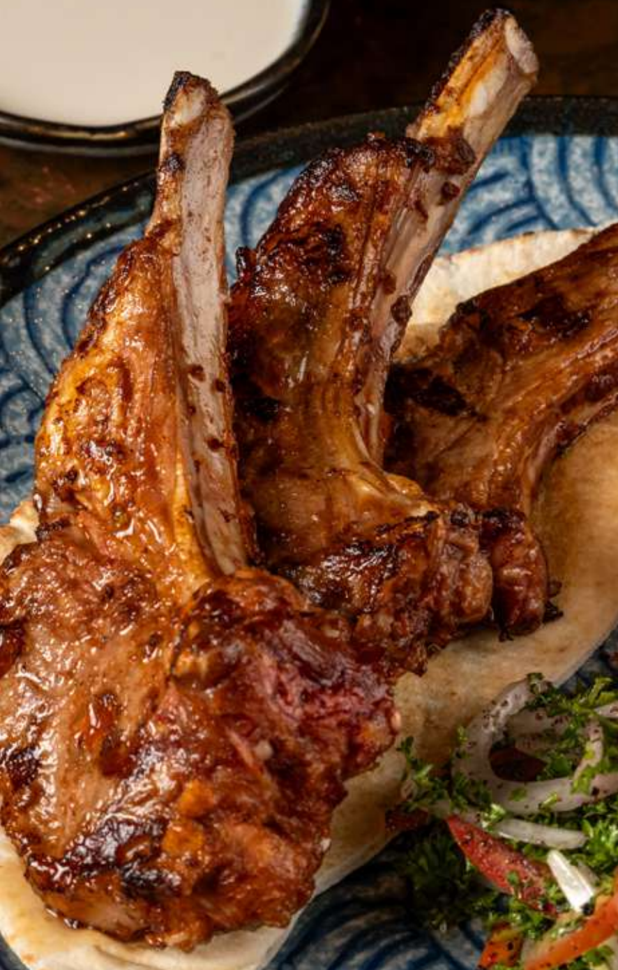
Rack of Lamb 990