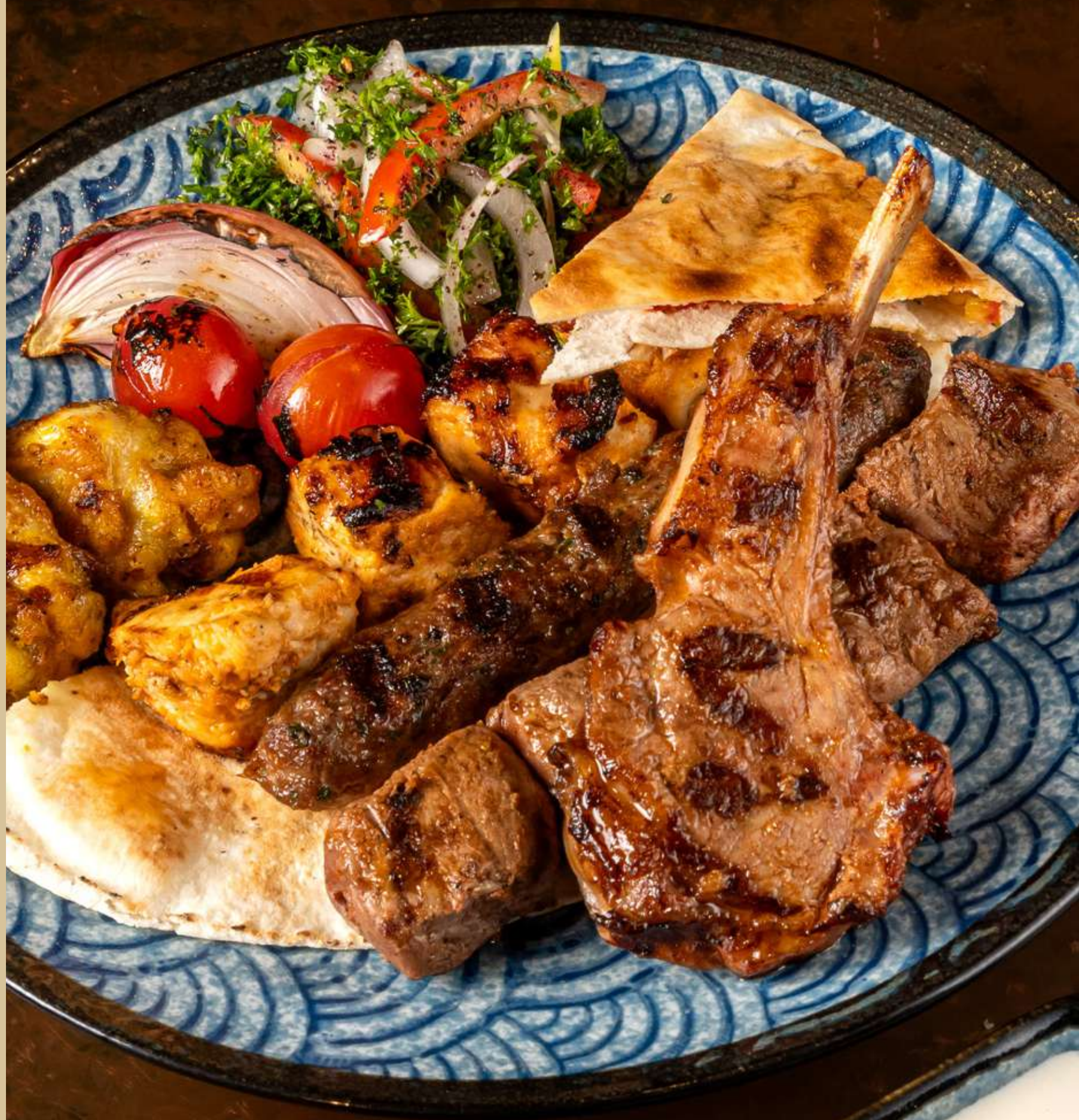
Mixed Grill 990