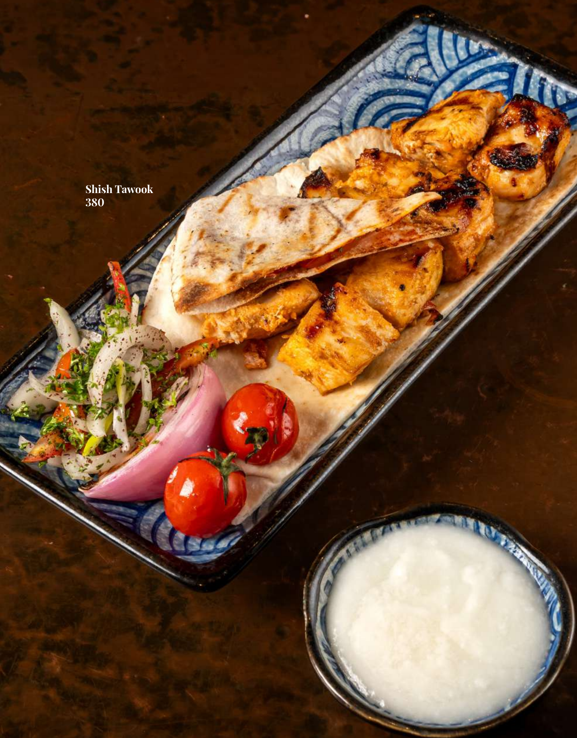
Shish Tawook 380