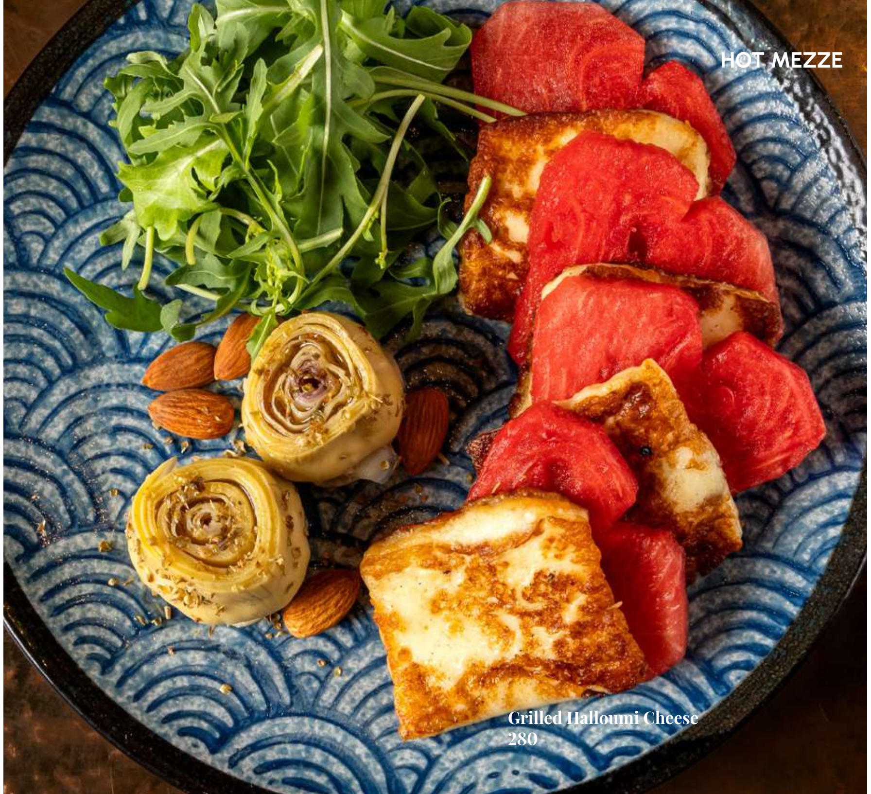
Grilled Halloumi Cheese 280