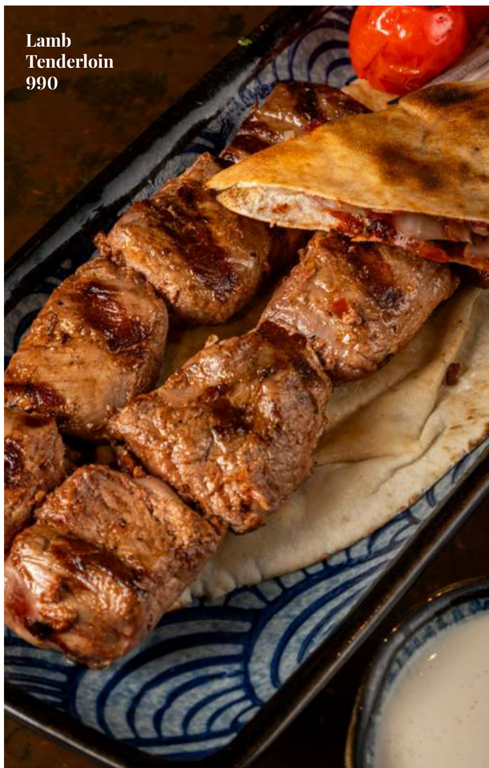
Lamb Tenderloin 990