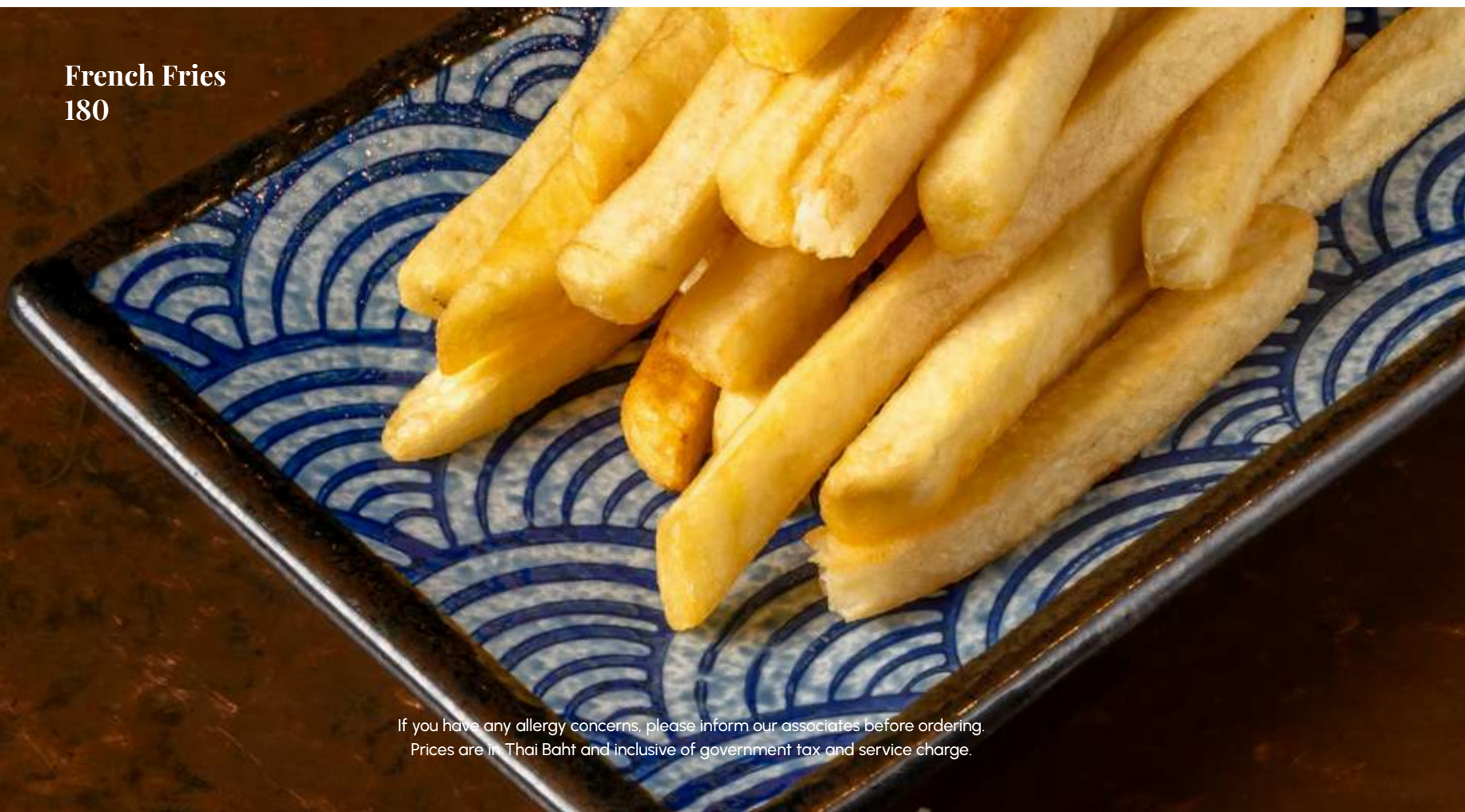
French Fries 180

If you have any allergy concerns, please inform our associates before ordering. Prices are in Thai Baht and inclusive of government tax and service charge.