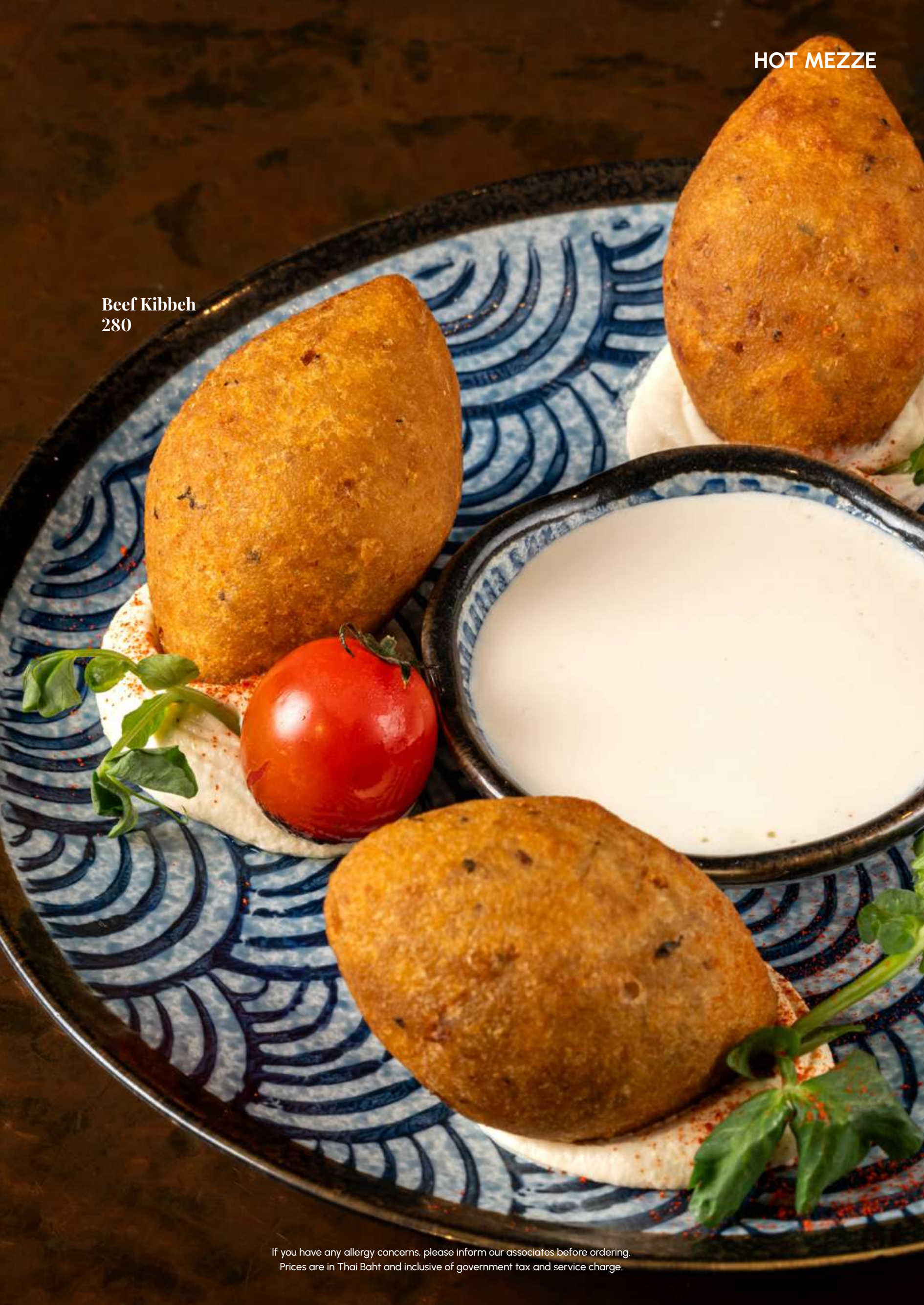
Beef Kibbeh 280

If you have any allergy concerns, please inform our associates before ordering. Prices are in Thai Baht and inclusive of government tax and service charge.