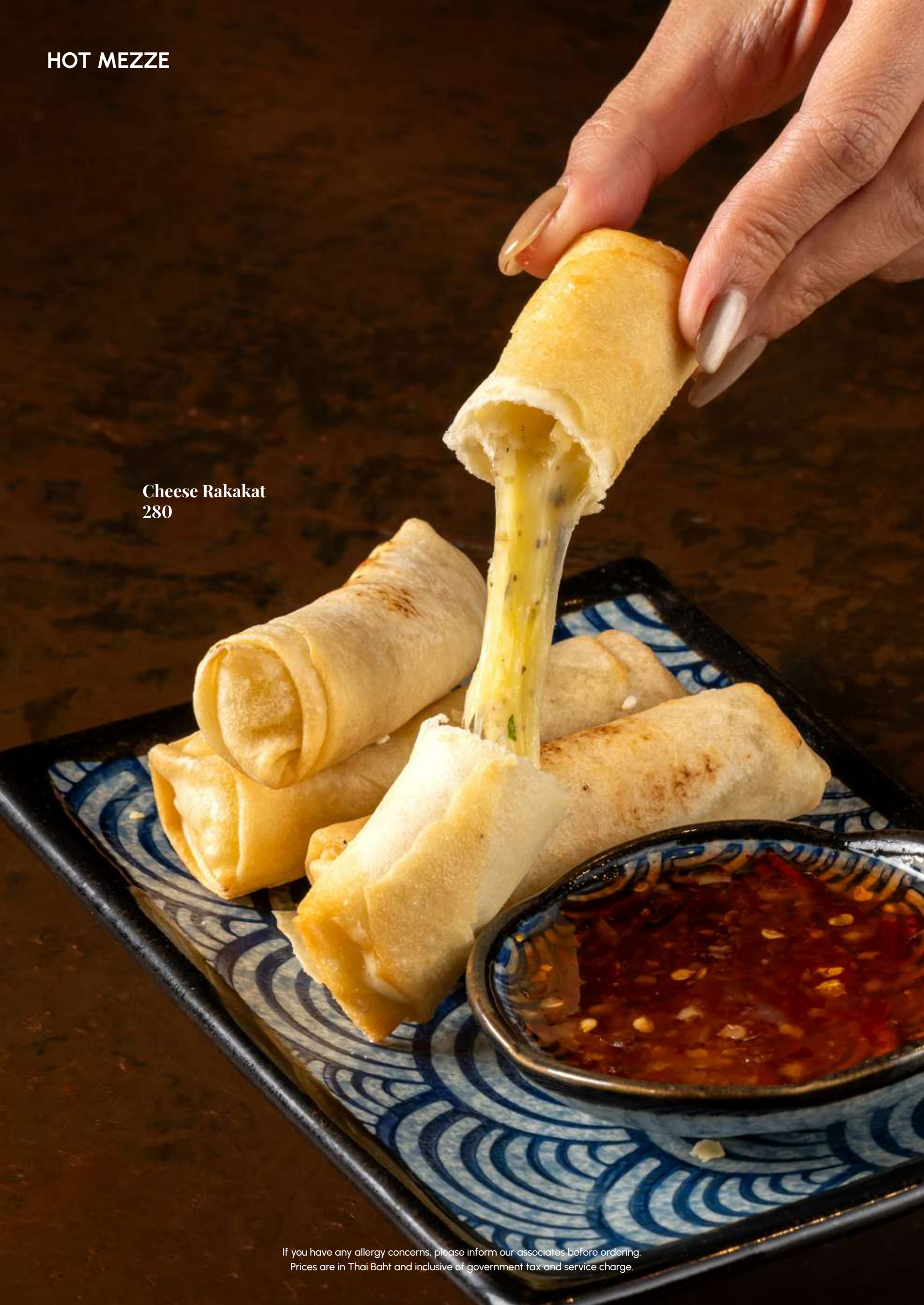
Cheese Rakakat 280

If you have any allergy concerns, please inform our associates before ordering. Prices are in Thai Baht and inclusive of government tax and service charge.