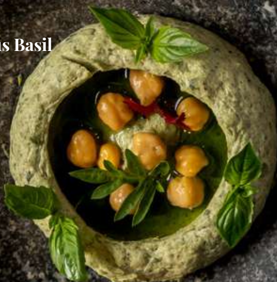
Hummus Basil 240