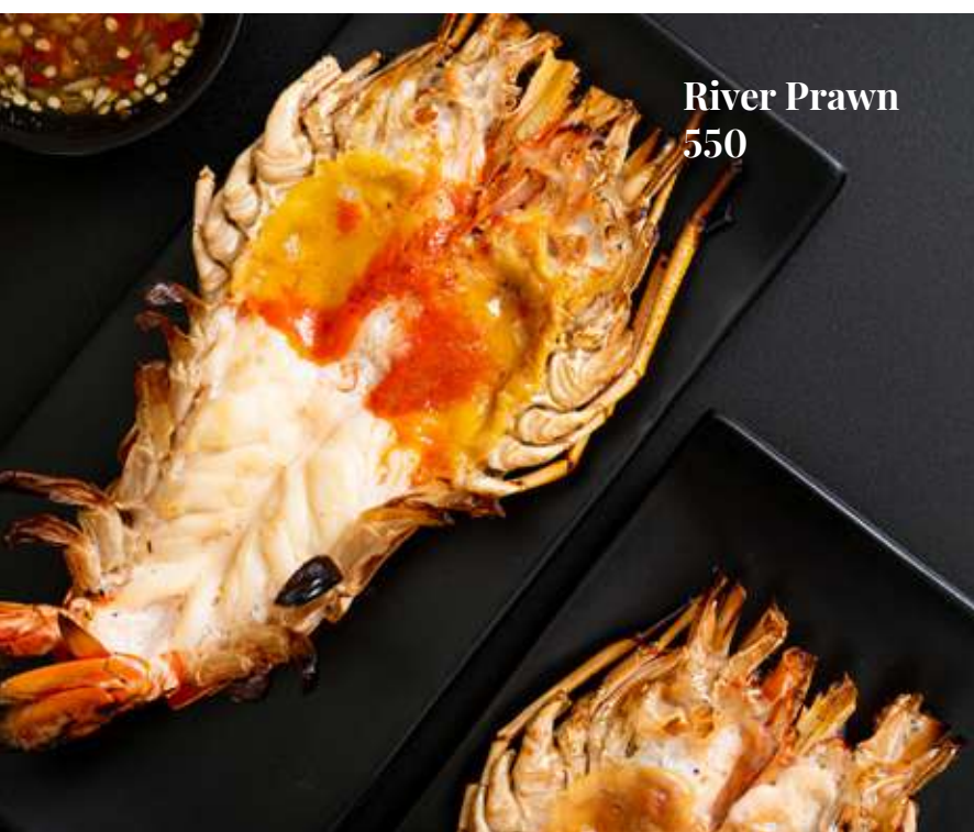
River Prawn 550

If you have any allergy concerns, please inform our associates before ordering. Prices are in Thai Baht and inclusive of government tax and service charge.