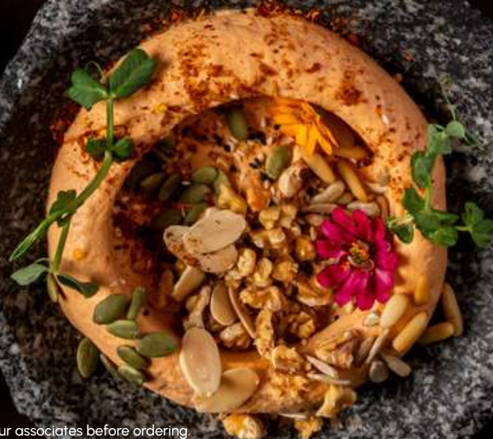
Spicy Tahineye 240

If you have any allergy concerns, please inform our associates before ordering. Prices are in Thai Baht and inclusive of government tax and service charge.